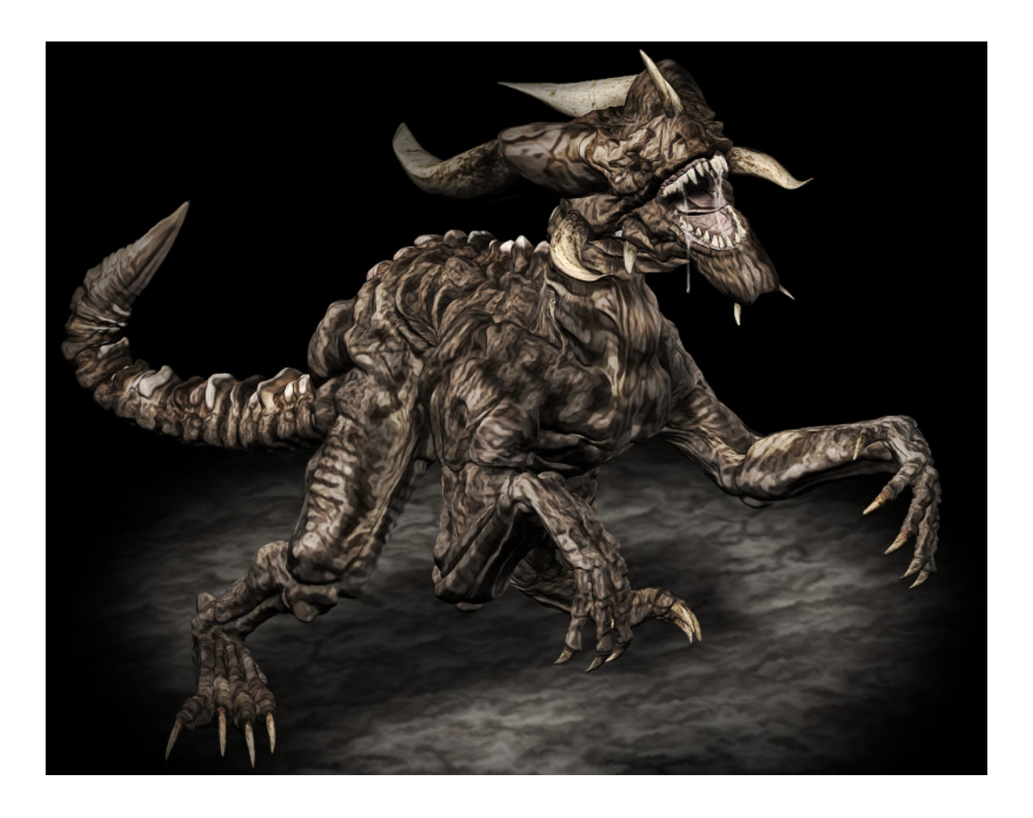
RPG Maker MV - Medieval: Bosses Crack English